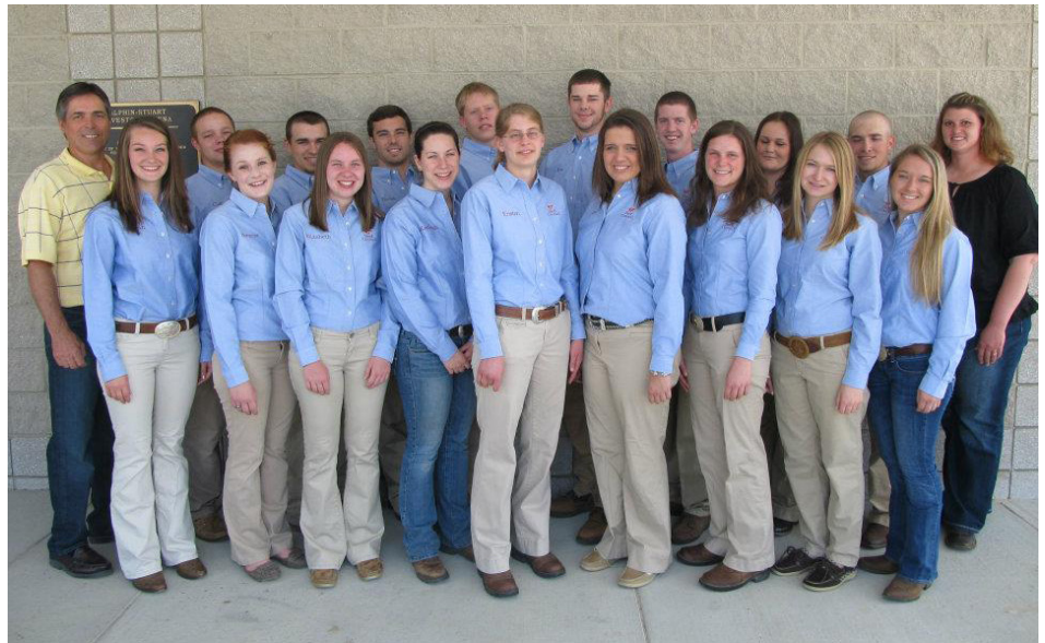
2012 Virginia Tech Beef Leadership Council