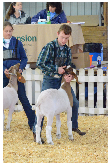
Youth meat goat exhibitors brace their animals for the judge at the 2012 Virginia Junior Livestock Expo.