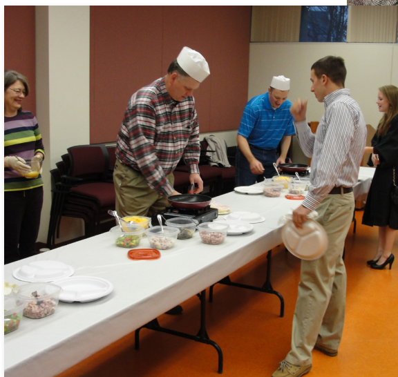
Students and their families enjoyed a special breakfast prepared by faculty members before the fall graduation ceremonies.