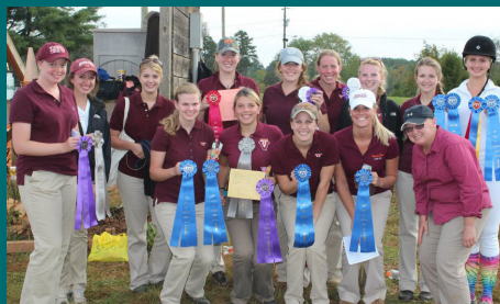
The Dressage Team has been quite successful so far this year