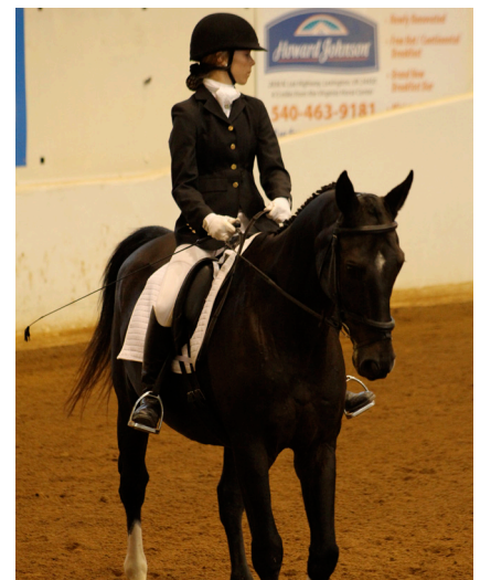
Top: The Rixeyville Riders from Culpeper County participated in Saturday night's Freestyle Drill Team Showcase.