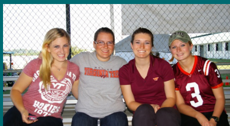
Members of the Western Team