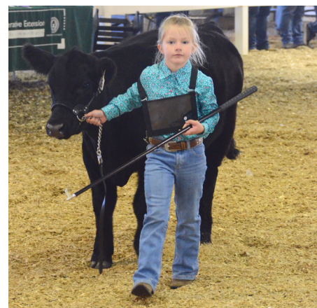
A 4-H/FFA youth exhibits a feeder steer at the 2012 Virginia Junior Livestock Expo in Harrisonburg.

Many congratulations are extended to all of these species winners as well as to the many exhibitors for their excellent species representations that came to the Virginia Livestock Expo.