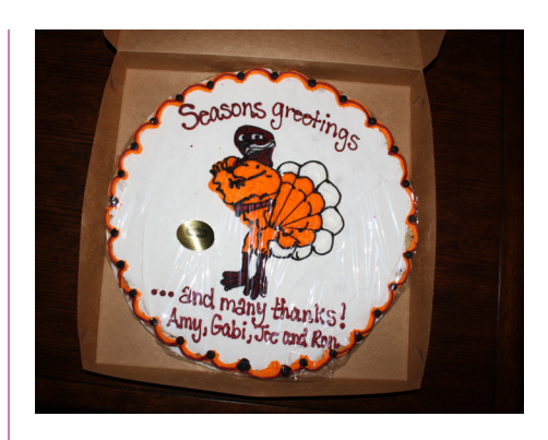
A Hokie Seasons Greetings, and a scrumptious thanks, to USMARC colleagues.

The mature (or metabolic) weight of a cow is often defined in terms of its live weight with some adjustment for body condition. Although ultrasound measures could contribute to that description, its use in cows is limited. A group of 87 mixed-aged cows varying in body